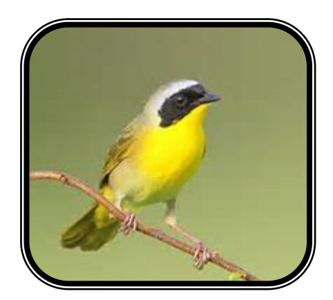
Common Yellowthroat Breeds in marshy areas in Southeast Idaho

Please contact Mark mark delwiche@q.com to learn more about this project and to volunteer.