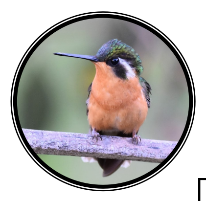
Female Purple-throated Mountain-gem