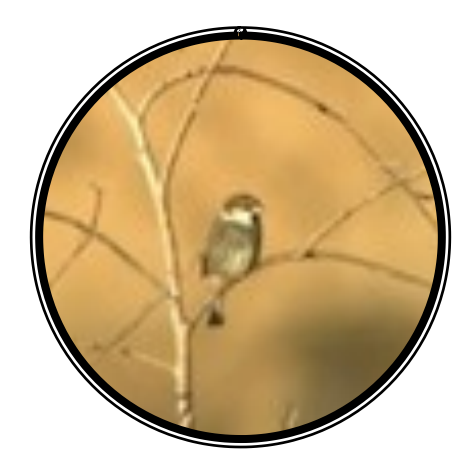
Spanish Sparrow Endemic to Iberian Peninsula Photo taken through our guide's scope on my recent trip to Portugal.

Currently, we expect our annual Members' Night to be held in April, but that might change depending on how we can schedule program presenters So please be thinking about which photos you'd like to share this year and send them, in jpeg format and high res-