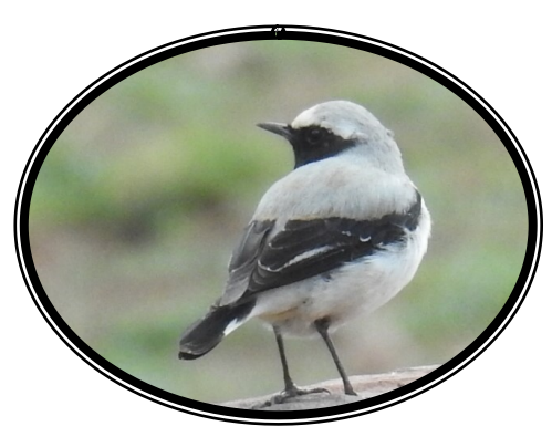
Atlas Wheatear

Nearly 170 species of birds were seen during the trip, including 70 for her life list. The program will include photos of many of the birds as well as the amazing rugged countryside. Many of the desert birds included a variety of larks and wheatears, as well as European birds that were migrating north after their African winter.