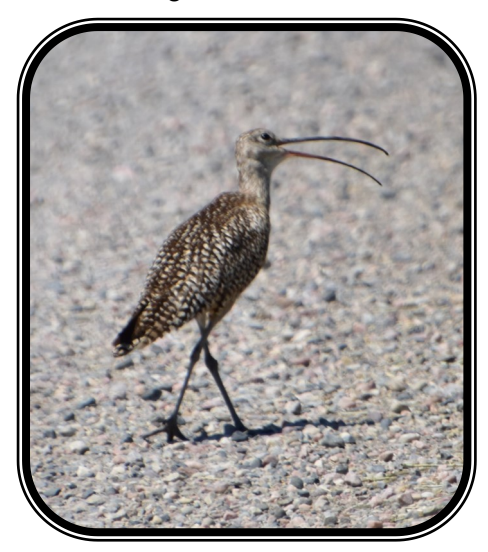
Long-billed Curlew at Camas NWR July 1

species of flycatchers and fallplumaged warblers. They have banded many Sage Thrashers and Loggerhead Shrikes that nest on the refuge.