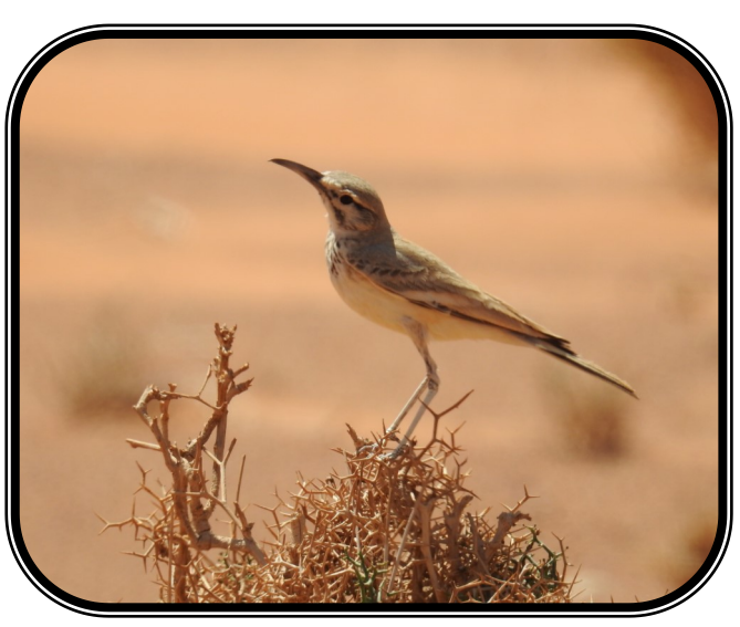
Hoopoe Lark

Nonprofit Organization U. S. Postage PAID Idaho Falls, ID 83401 PERMIT NO. 115